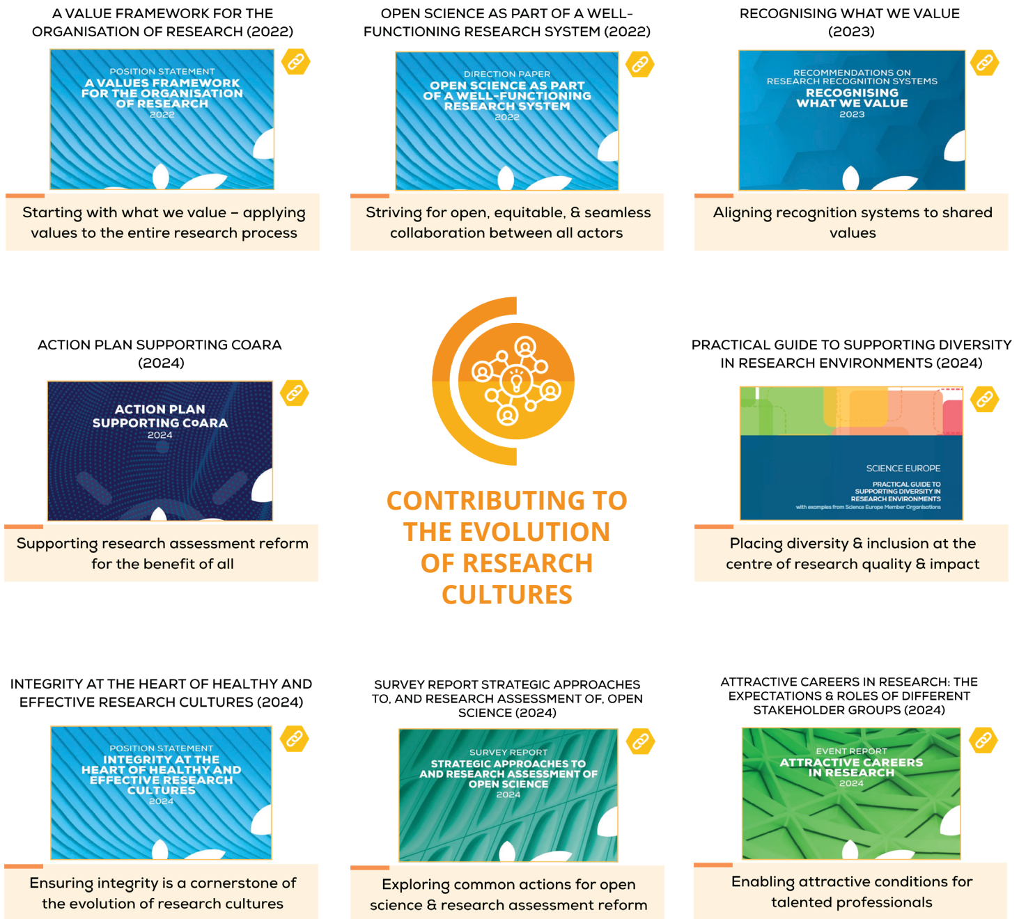
Figure 1 – An overview of the diverse actions Science Europe has conducted in 2021–2024 as part of its work towards the strategic priority of ‘contributing to the evolution of research cultures’.