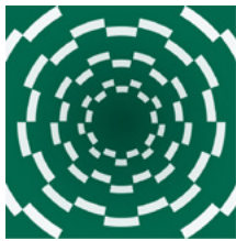
Lietuvos mokslo taryba